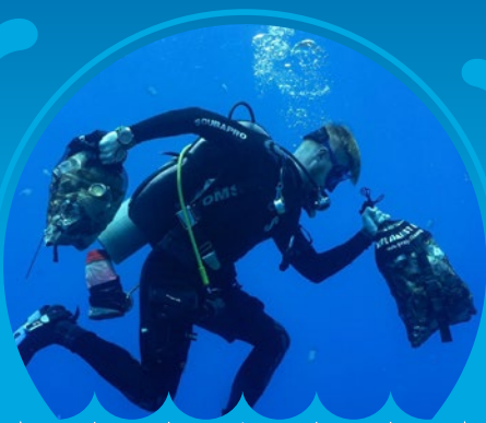
MARINE DEBRIS REMOVAL in Dominican Republic