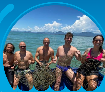
MARINE PROTECTION in Greece

Read all the inspiring grantee stories HERE