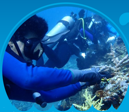
CORAL RESTORATION in Indonesia

••• In 2023, grants included, but weren't limited to •••